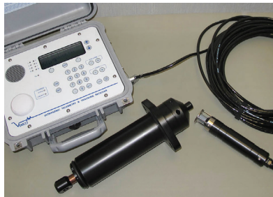
The VHTx transponding hydrophone pictured with the VR2AR and the VR100.

sonic transmitters on passing fish or equipment. The VHTx operates within the 50kHz to 85kHz frequency range. The hydrophone is protected by a cage and is weighted to aid in lowering the hydrophone into water.