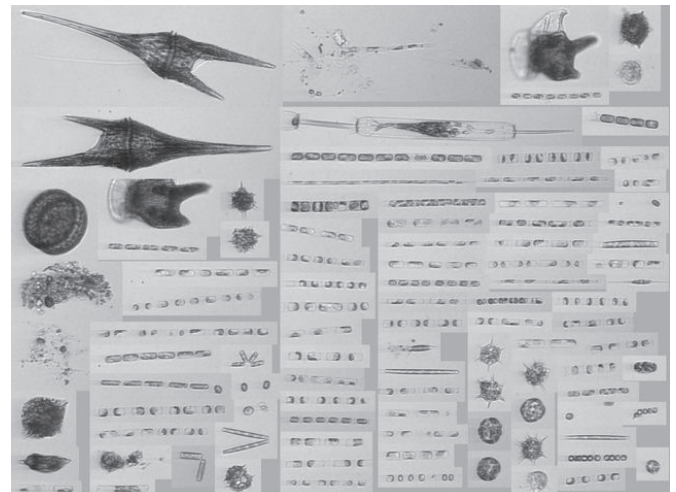
Example Mosaic from IFCB Dashboard (not to scale)

This product complies with 21CFR1040.10 and 21CFR1040.11