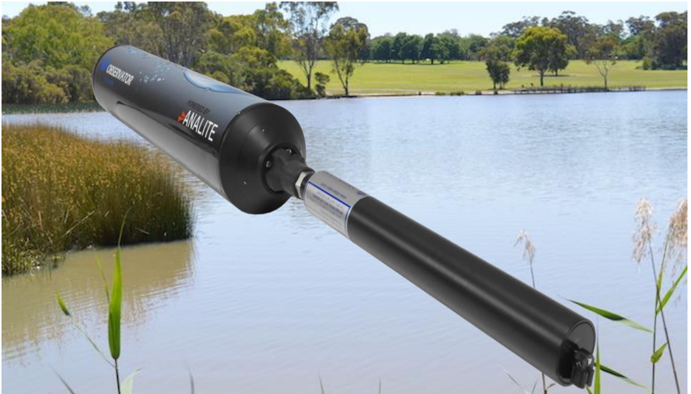
Suitable for long-term turbidity & temperature monitoring & logging