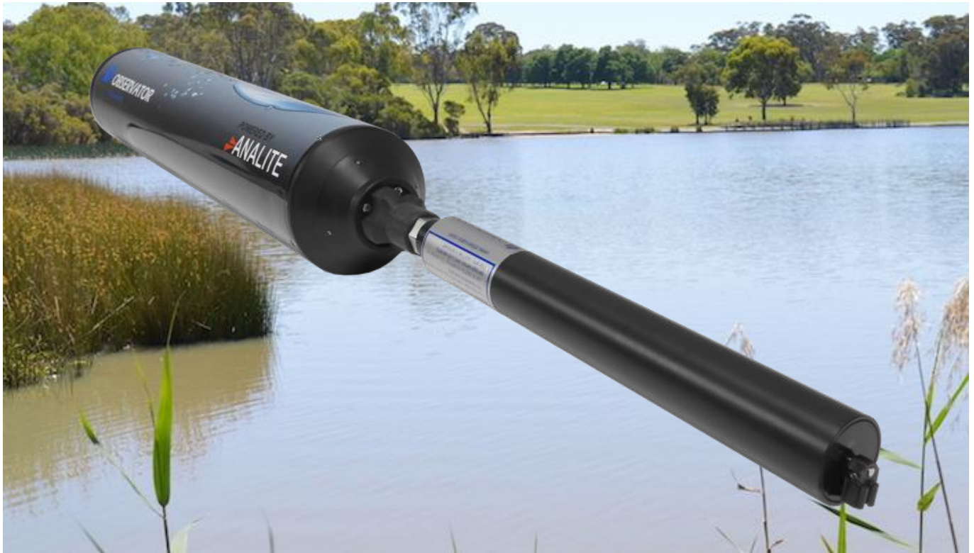
Suitable for long-term turbidity logging